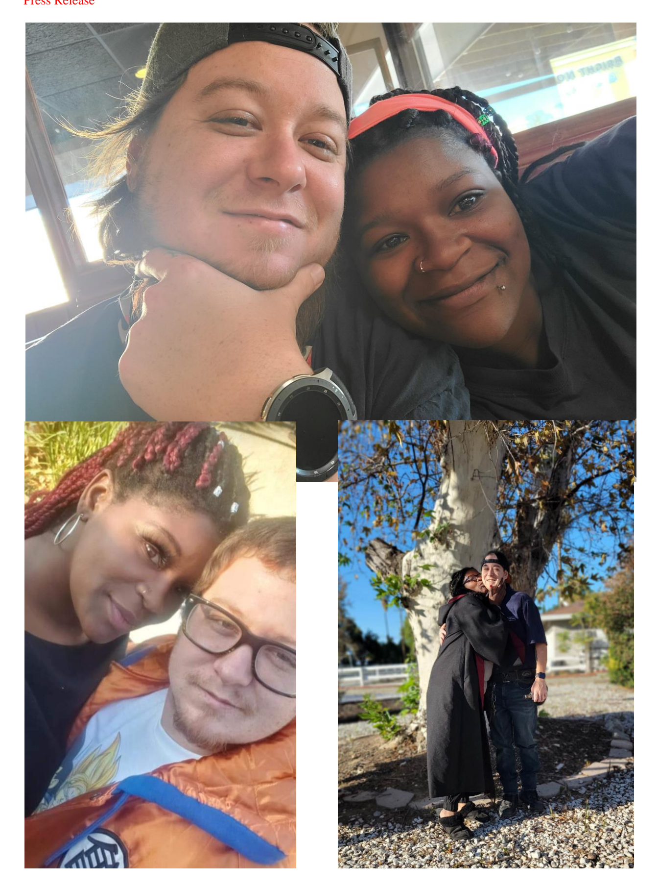
Page 4 of 4